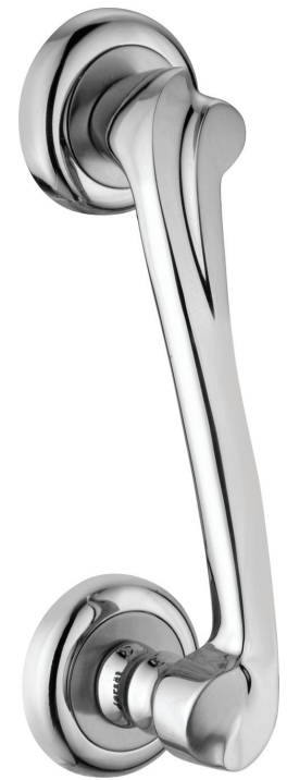
IN 10 PR SS