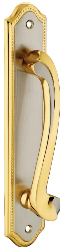
IN 10 PP SG