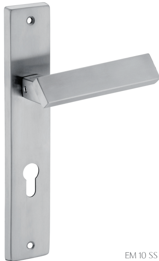
EM 10 SS