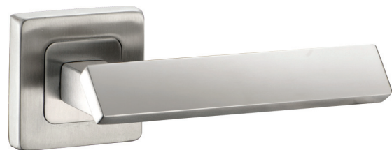
EM OR SS